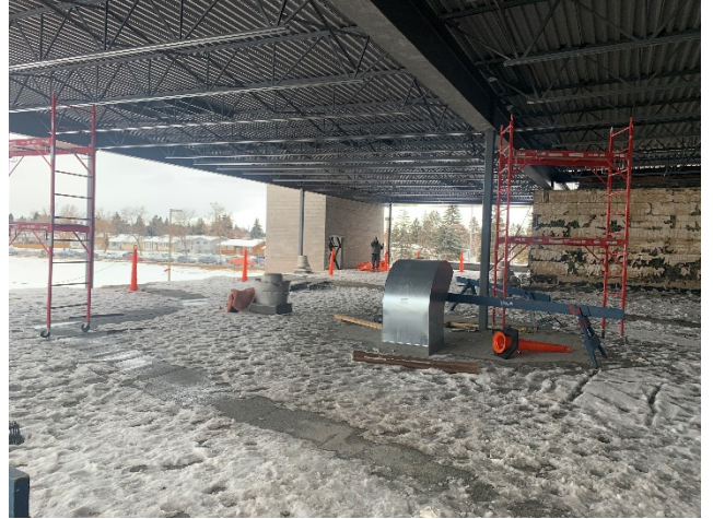
Area 6 - Structural