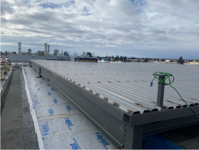
Area 6 Roof