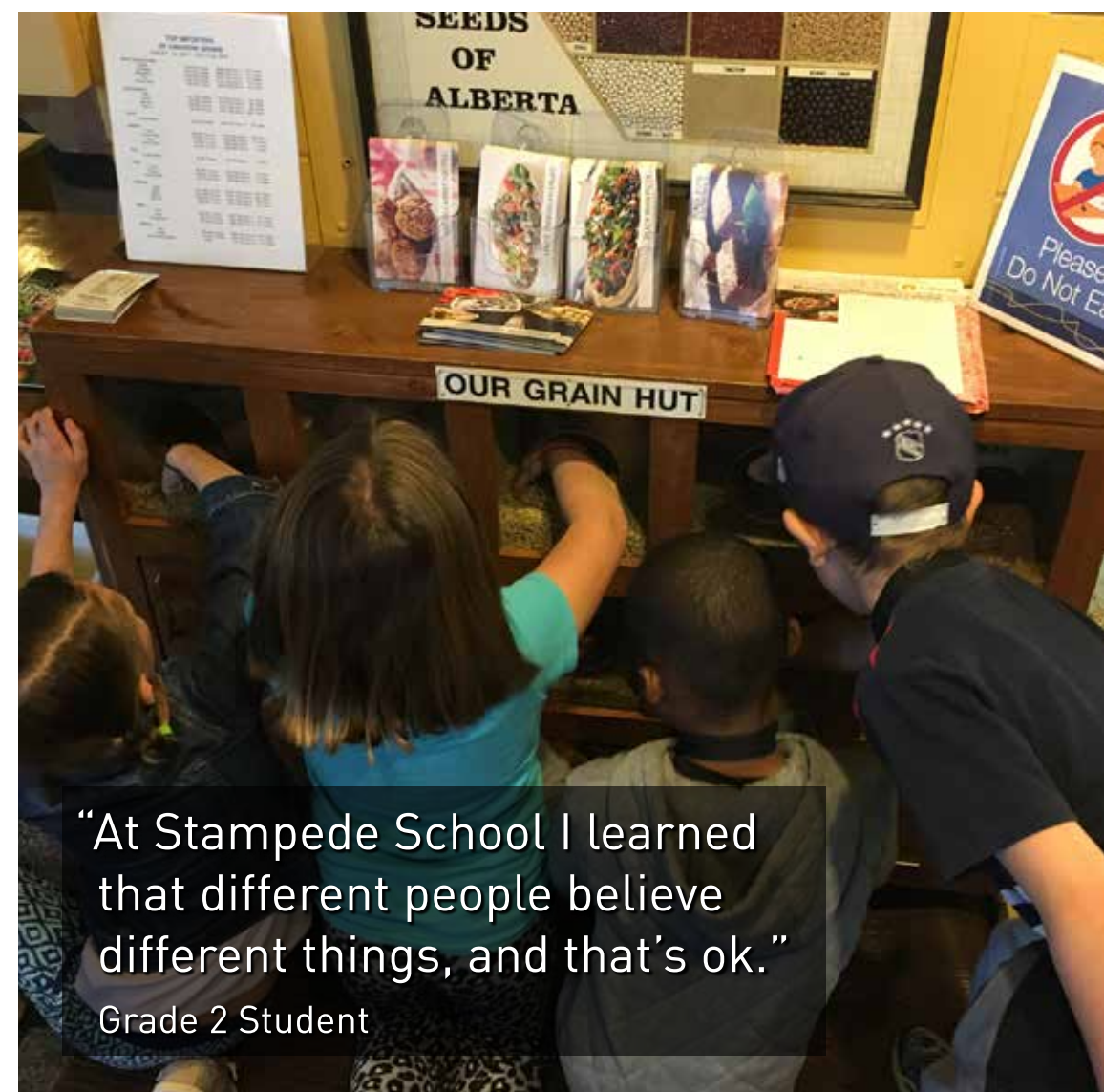
"At Stampede School I learned that different people believe different things, and that's ok." Grade 2 Student