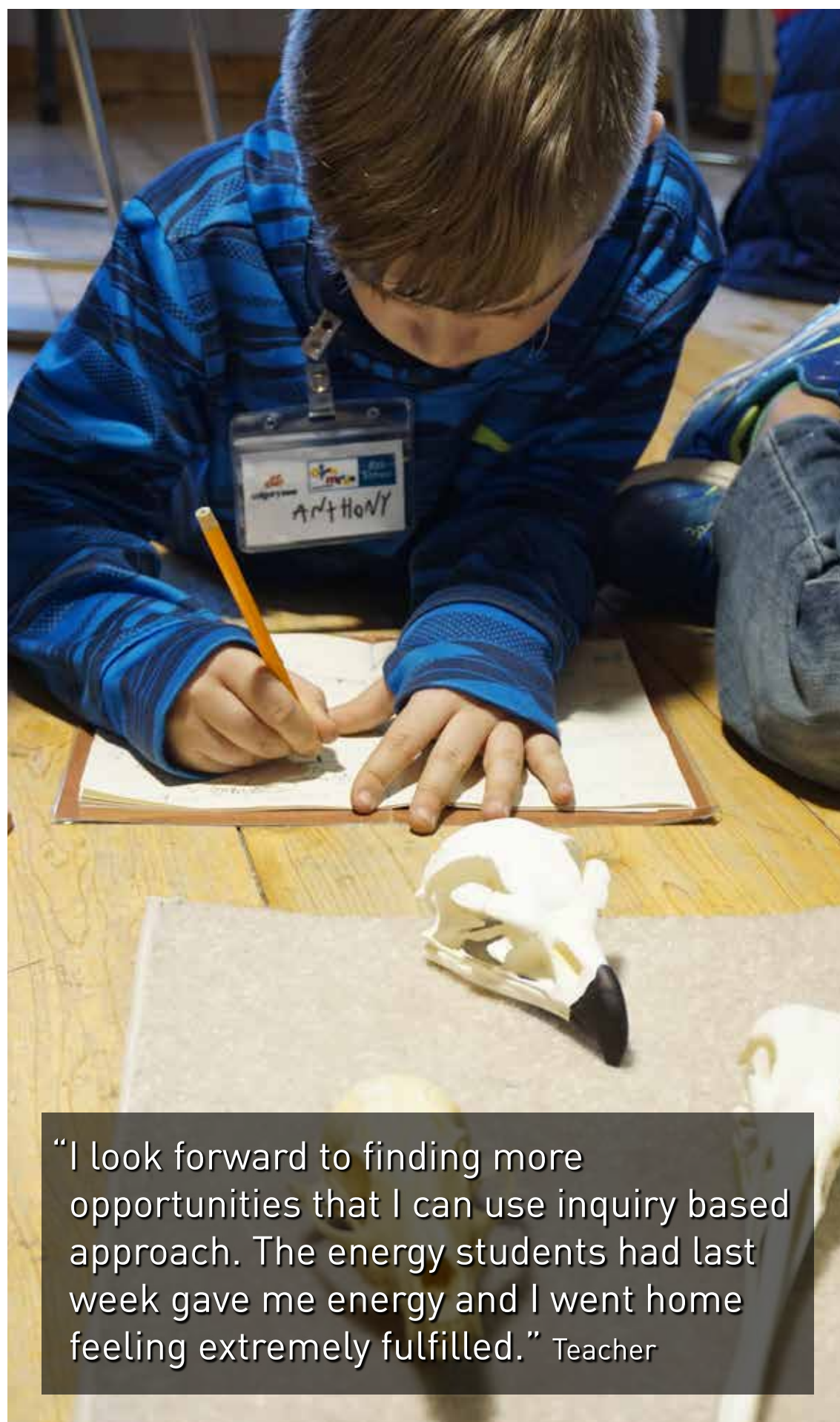
"I look forward to finding more opportunities that I can use inquiry based approach. The energy students had last week gave me energy and I went home feeling extremely fulfilled." Teacher