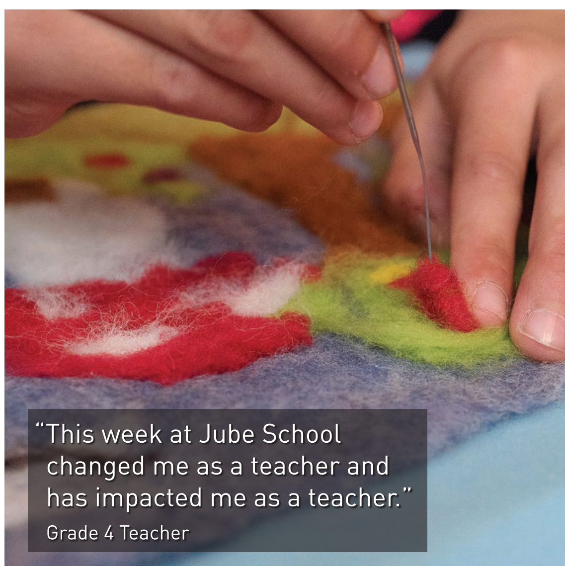
"This week at Jube School changed me as a teacher and has impacted me as a teacher." Grade 4 Teacher