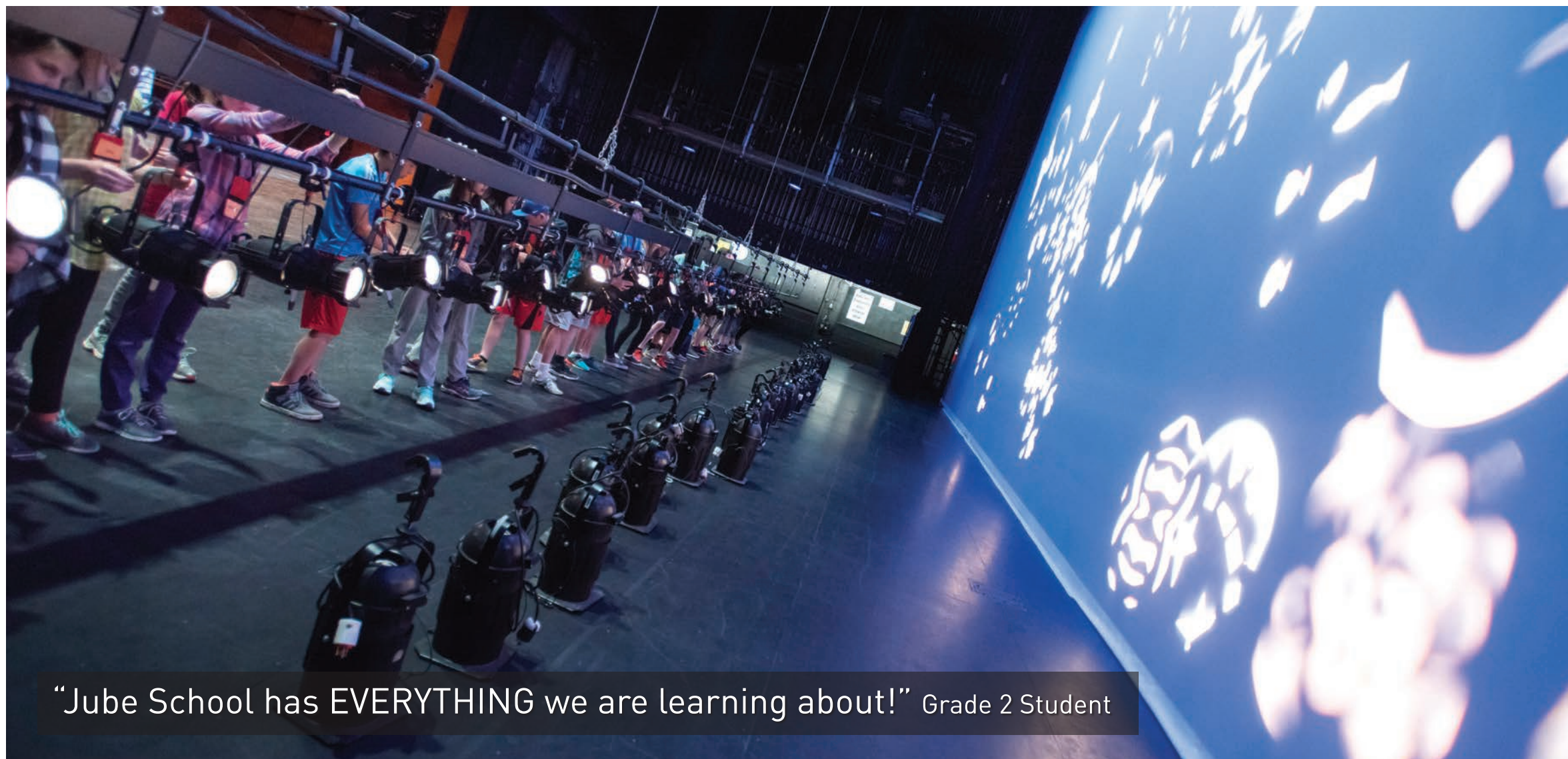
"Jube School has EVERYTHING we are learning about!" Grade 2 Student