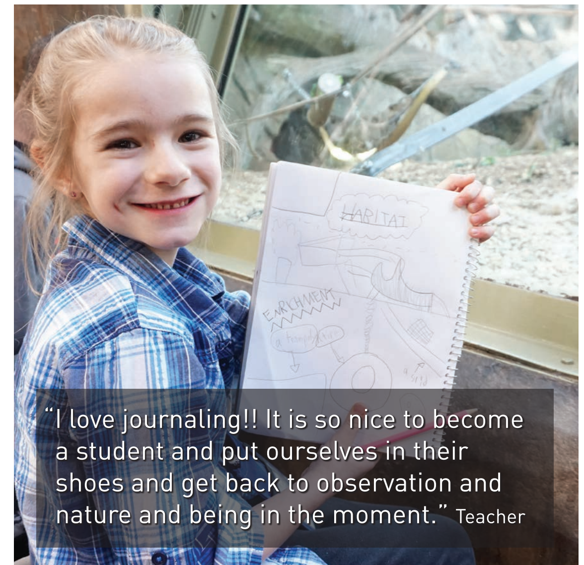
"I love journaling!! It is so nice to become a student and put ourselves in their shoes and get back to observation and nature and being in the moment." Teacher