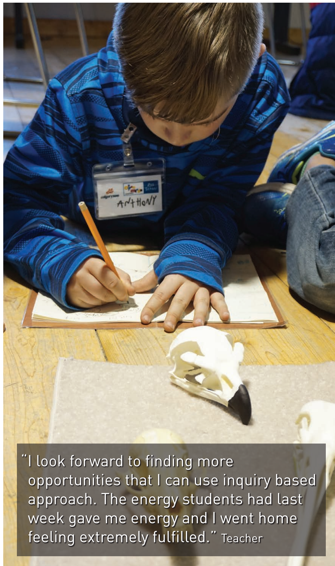
"I look forward to finding more opportunities that I can use inquiry based approach. The energy students had last week gave me energy and I went home feeling extremely fulfilled." Teacher