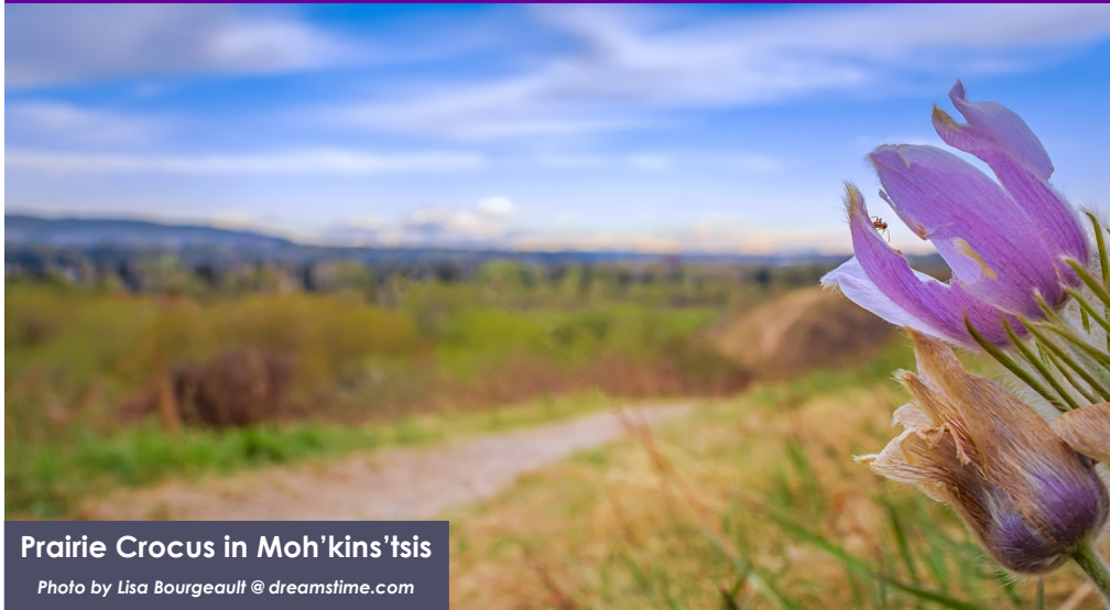
Prairie Crocus in Moh'kins'tsis