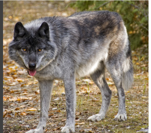
Mazini/Wolf