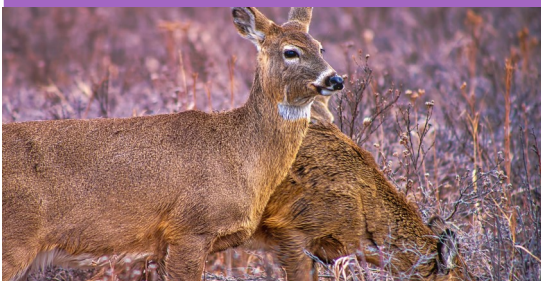
White Tailed Deer