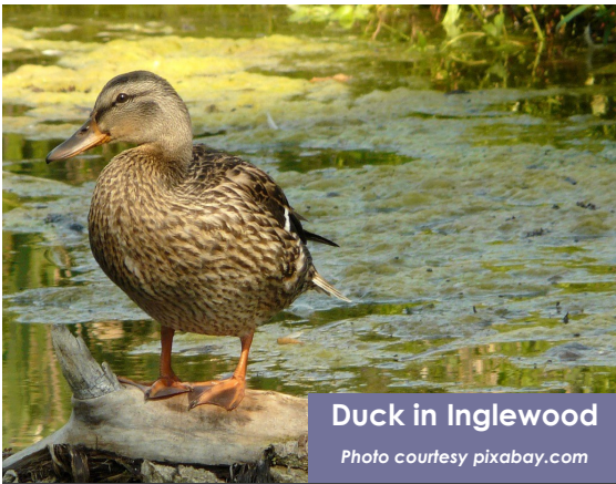
Duck in Inglewood