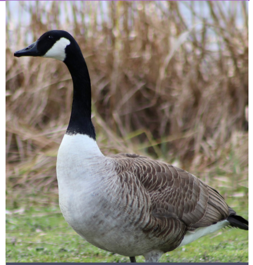
Niska (Canada Goose)