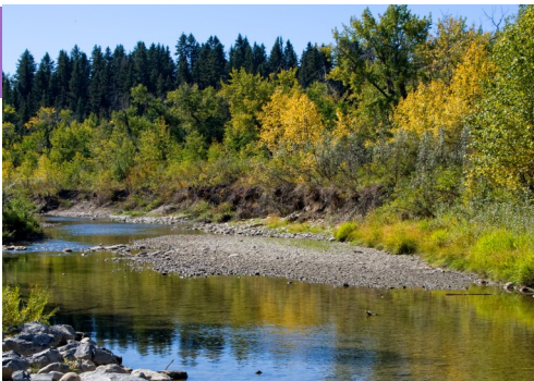
Wolf Creek/ Fish Creek