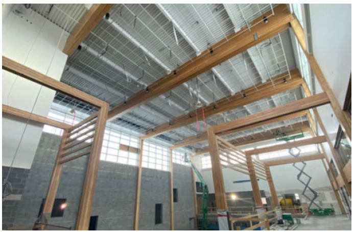
Gathering Space – 2<sup>nd</sup> floor balcony