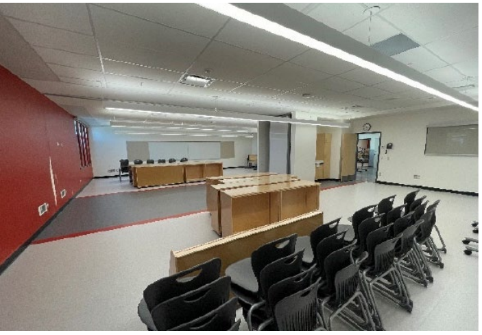
Classroom – Middle school (typical)