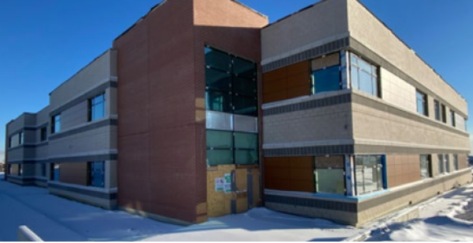
North-West Elevation (classroom wing)