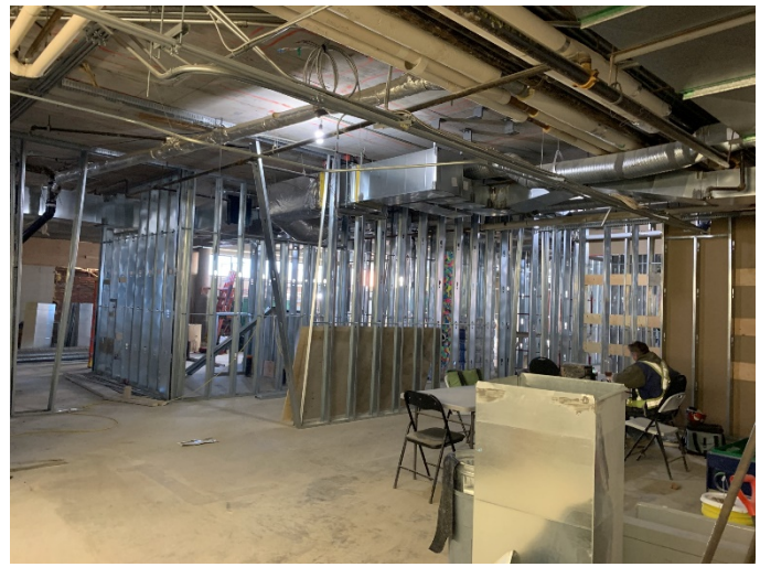
Interior Framing underway