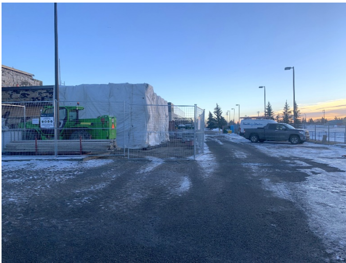
New Exterior Stairs - hoarding