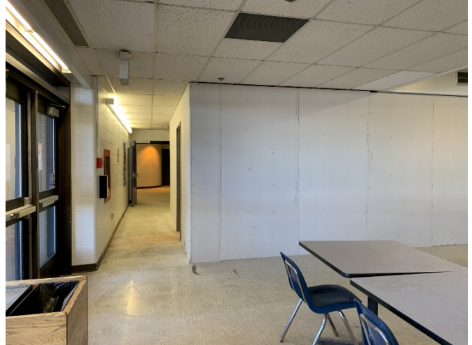
New Offices – hoarding